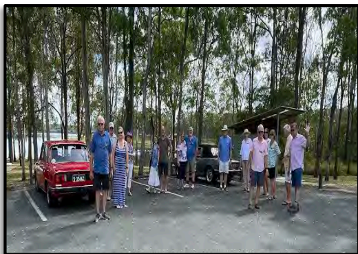
Pitstop at Bullocky Rest