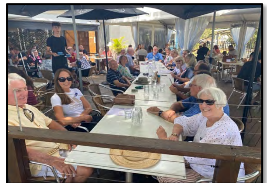
The entourage arrived safely and proceeded to enjoy their morning at Sea Salt and Vine