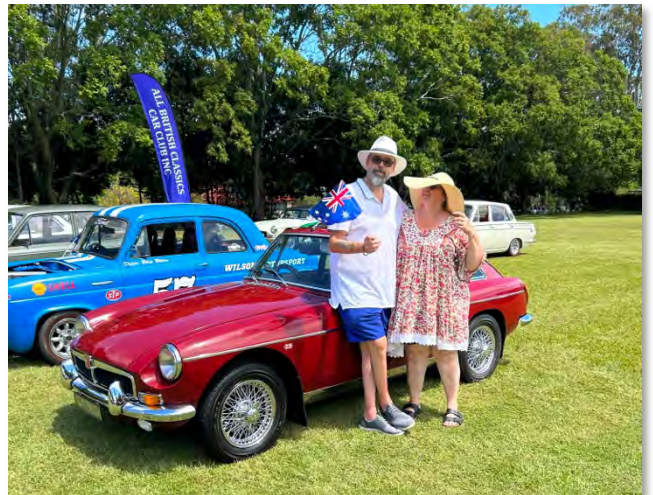
A family friend ( frenemie ) with his recently purchased 1976 MG BGT, which drew in lots of interest on the day.